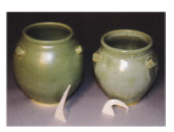
Some glazes look okay when underfired a little (on left), but create different effects when reaching their full temperature.

Same glaze: the left bowl had a thinner application and 14 hours firing. The right bowl had a thicker application and faster firing (9 hours).